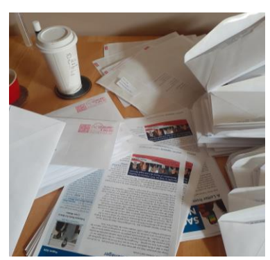
SAGEVets Newsletter kit (coffee not included)

We are requesting your help in getting the word out about a two-part virtual program that will address the history of discrimination in the U.S. military against LGBT service members and the remarkable evolution we have seen since Don't Ask Don't Tell (DADT). Additionally, we will focus on the Restoration of Honor Act (RoHA). SAGEVets is partnering with the NYSDVS for this exciting program that kicks off on November 19 (more info below). We will share personal stories about how the inclusive RoHA legislation can help veterans who received an Other Than Honorable Discharge or a General Under Honorable Conditions Discharge.